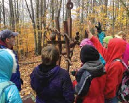
Volunteer tour guide, Phil Cook (left), with Crystal Lake Elementary fifth graders during their field trip last fall.